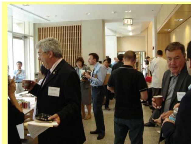
GLC-ASPET Scientific Meeting attendees enjoy a mid-afternoon break of chatting, networking, and refreshments between the Symposium and the Keynote address.