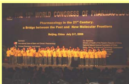
Chinese student volunteers perform at the Opening Ceremony

Many of the topics are ones of critical interest to scientists worldwide but are not traditionally covered at domestic U.S. meetings (e.g. malaria therapy, traditional medicine, chronopharmacology). There were several sessions focusing on regulatory issues as well as on education.