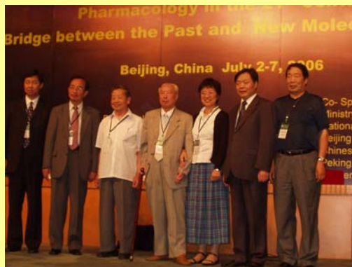
The Chinese National Committee for IUPHAR 2006