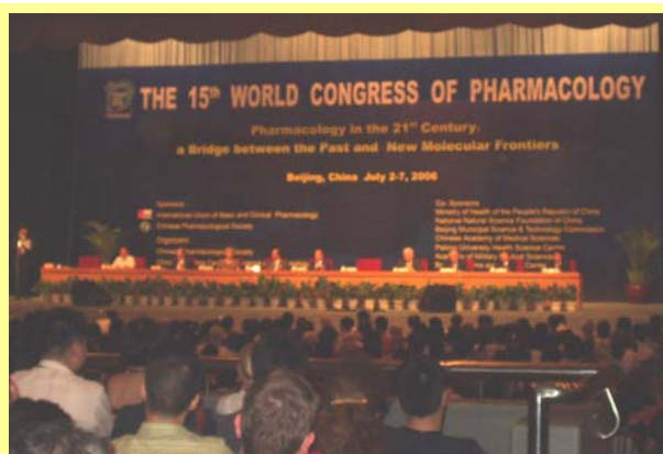
Opening ceremony of the 15 th World Congress of Pharmacology

The Program consisted of 23 plenary lectures and symposia with 264 invited speakers from around the world. Program topics covered the range from molecular through clinical pharmacology and from the pharmacology of traditional medicines to gene- and cell-based therapies for disease. Many of the topics are ones of critical interest to scientists worldwide but are not traditionally covered at domestic U.S. meetings (e.g. malaria therapy, traditional medicine, chronopharmacology). There were several sessions focusing on regulatory issues as well as on education.