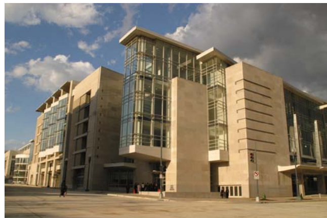
Washington Convention Center