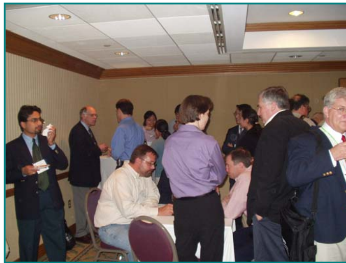
Pictures from the joint Drug Metabolism/Toxicology Mixer at Experimental Biology '04