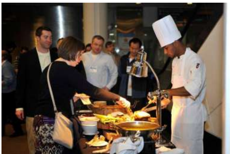
Meeting attendees enjoy refreshments and socializing at the ASPET/British Pharmacological Society Opening Reception following the ASPET Business Meeting.