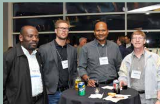
Pictures from the opening reception