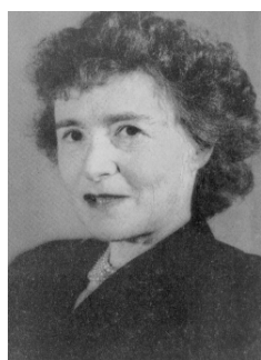
Gerty Cori (1934)