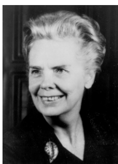
Janet Travell (1933)