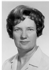
Eva King Killam John J. Abel Award (1954)