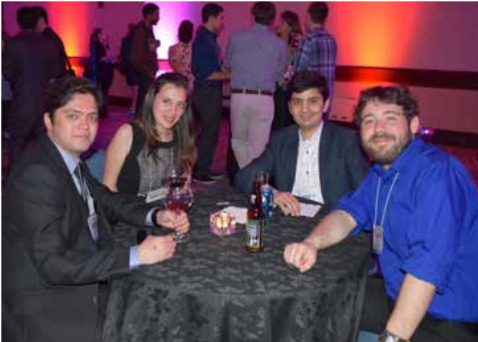
ASPET Student/Postdoc Mixer

Following the poster competition, ASPET Students and Postdocs let their hair down at the Student/Postdoc mixer. Young members enjoyed drinks, dessert, and dancing!