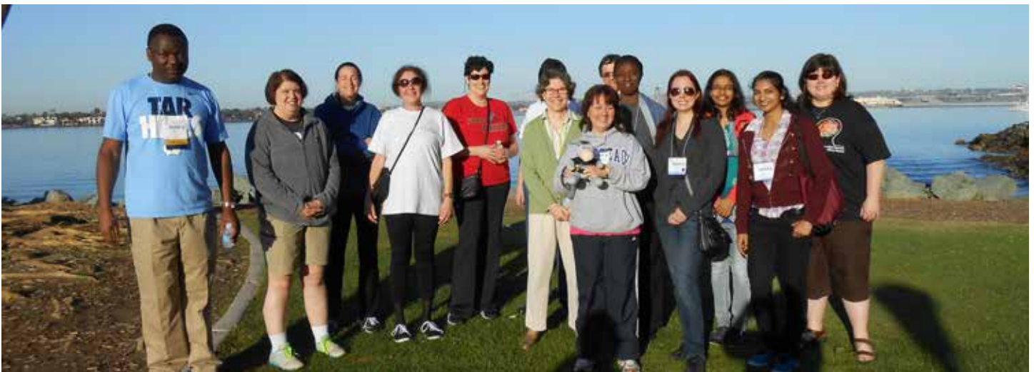
Members enjoy a nice walk along the San Diego harbor

To view the full album of EB 2014 pictures, visit us online at: http://bit.ly/SOfcAn