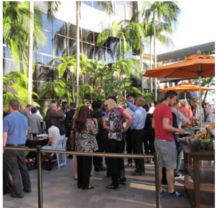
Members enjoy the closing reception poolside at the Marriott

The ASPET Networking Walk took place on Tuesday, April 29. ASPET members gathered for a walk around San Diego. Members walked along the waterfront and enjoyed time talking and networking with each other. Walkers enjoyed a hearty breakfast afterward before heading off to more scientific sessions.