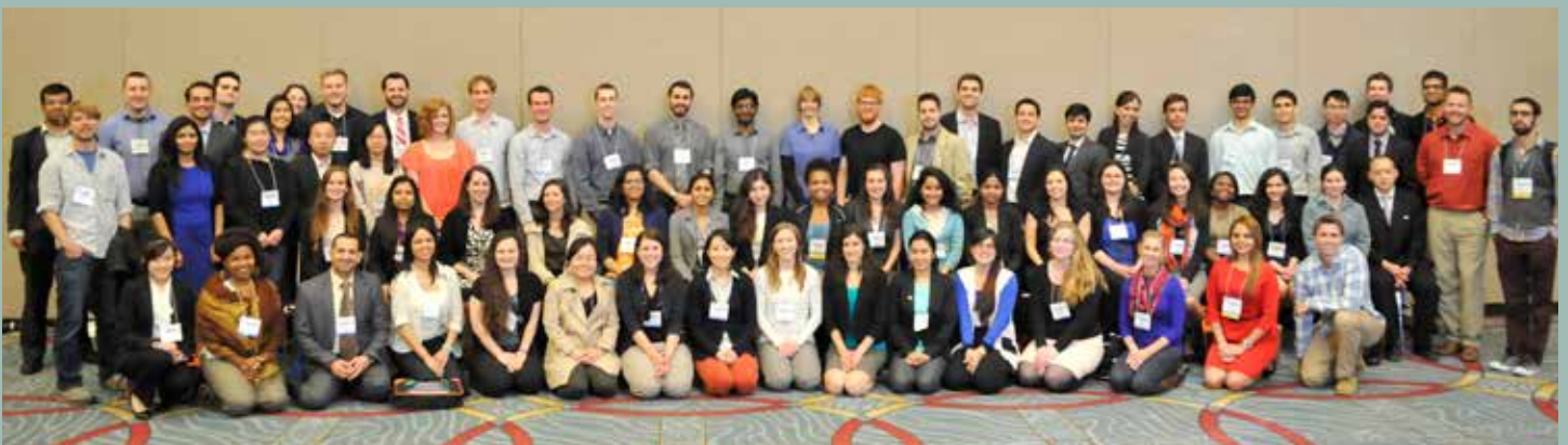
2014 ASPET Graduate Student Travel Award Winners