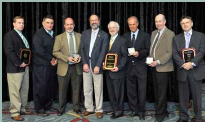
2014 ASPET Award Winners

Following the ASPET Business Meeting, members kicked off the start of the 2014 Annual Meeting with an opening reception. The opening reception featured carving stations, an open bar, and a lively atmosphere for members to catch up with old and new friends. Also at the opening reception, ASPET staff took pictures for a new “I am an ASPET member” marketing