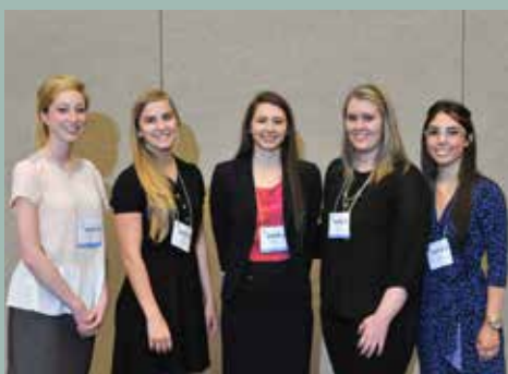
2014 SURF Travel Award Winners