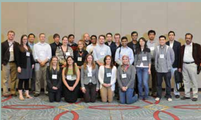
2014 ASPET Young Scientist Travel Award Winners