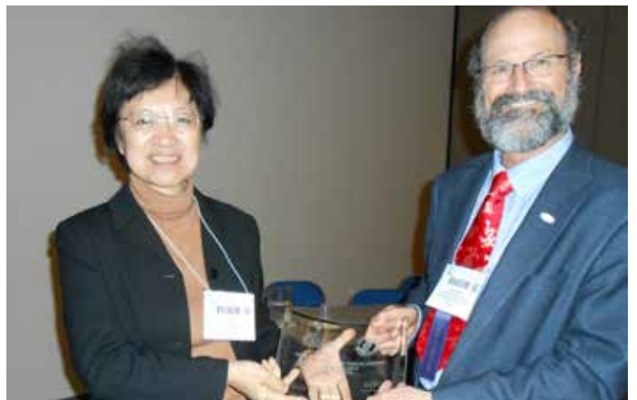
ASPET hosted a welcoming ceremony for visiting CNPHARS members.

ASPET booth had great traffic with both member and non-member visitors. We signed up 42 new members and showcased our newly branded marketing materials, brochures, flyers, and products. If you haven't already had a chance to view our new Guide to Member Benefits brochure, be sure to take the time to download it now at www.aspet.org/Guide_to_Member_Benefits . As part of our re-branding efforts, this new guide was created to make sure our members are taking full advantage of ASPET membership. Also at the booth, we sold t-shirts, hats, plush donkeys, lunch bags, and mugs featuring our new logo. If you didn't get an ASPET logo'd product, you can still make purchases online at www.aspet.org/store .