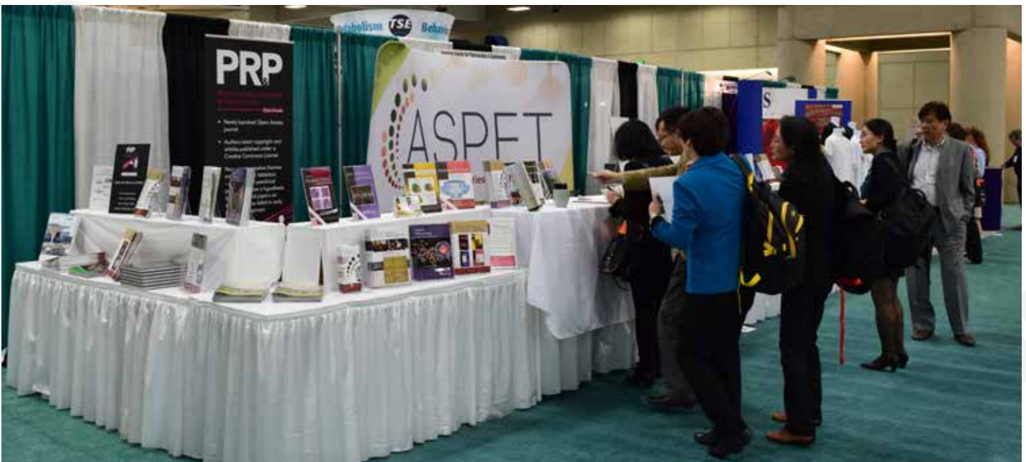
ASPET Exhibit Hall Booth