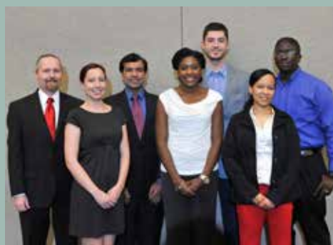
2014 Washington Fellows Travel Award Winners