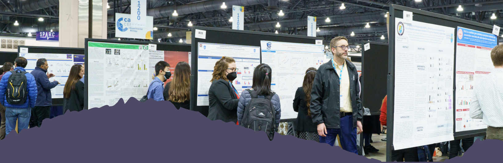
EXHIBIT WITH ASPET